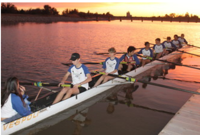
OSSM Rowing Team