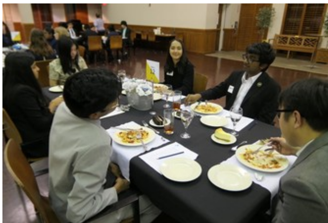
Students converse during Etiquette training