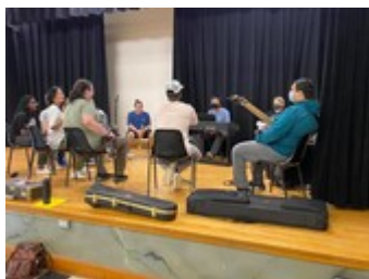
Fine Arts returns to the OSSM campus