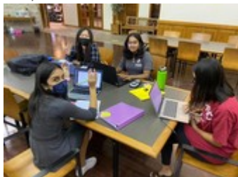
Students study during the evening study hours