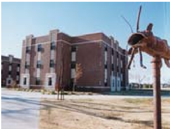
Dan Little Residence Hall at OSSM

Housing and meals will be provided for teachers who wish to stay on campus. Meals will be provided for commuters. Registration/Move-in time: 6:30-7:30 p.m., June 7, Sunday.