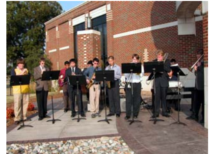
Jazzing up Oklahoma Hills