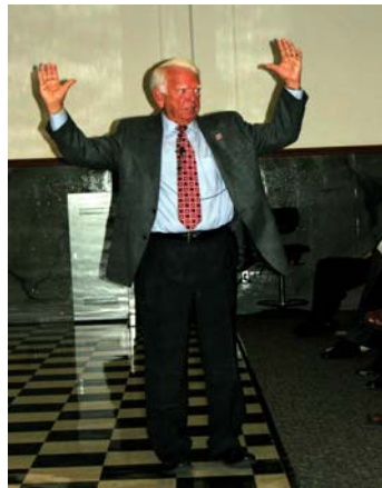
Governor Nigh -- a very expressive (and impressive) speaker