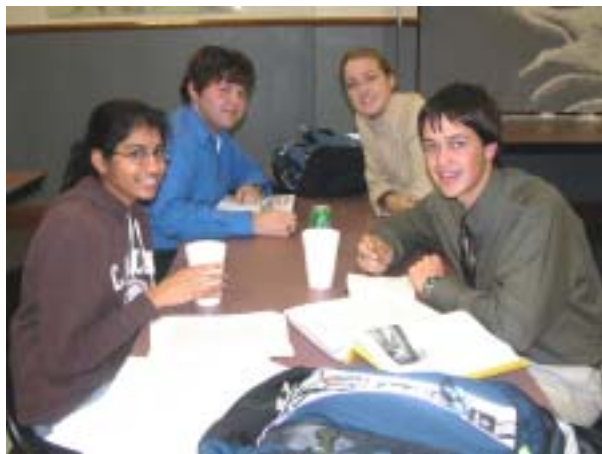
Studying continues . . . even during a cookie break!